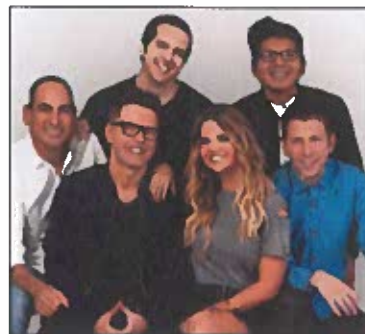
Bobby Bones Show Cast.